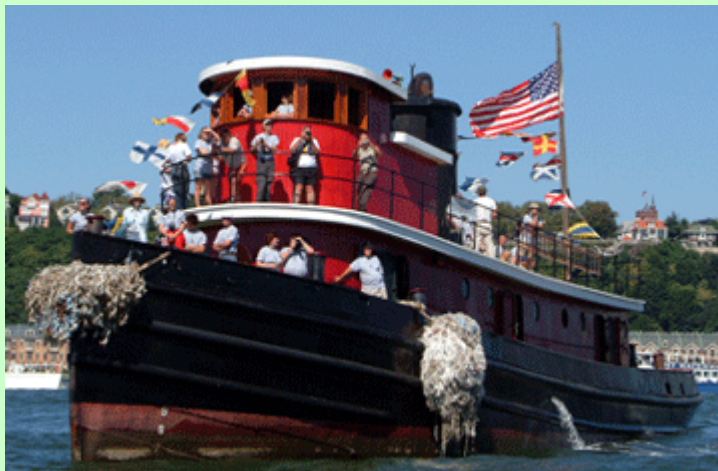
Ride this tug!!!

You asked for them so now Working Harbor Committee is going to offer new tours on board working and historic tugs. These special tours will be onboard the following tugs: