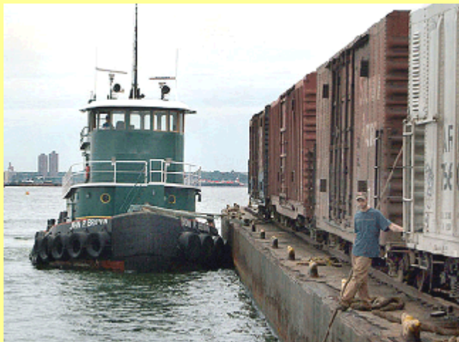
A RR carfloat bound for Brooklyn

Order Your Tickets for 10 May (and other tours) Now!!! PLUS - New Hidden Harbor Tour.....Brooklyn's Maritime History & Future