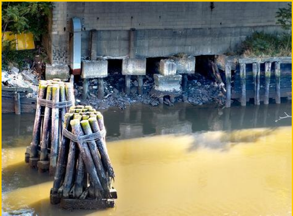
Beautiful colors in Newtown Creek

Newtown Creek - English Kills - Maspeth Creek - Dutch Kills