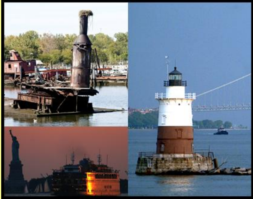
Top Left: Graveyard of Ships (c) Mitch Waxman Bottom left: Staten Island Ferry With Statue of Liberty (c) Bernie Ente Right: Light house (c) Bernie Ente

Subway: 1 to South Ferry, R/W to Whitehall St. or 4/5 to Bowling Green Tickets: $60/$50 for