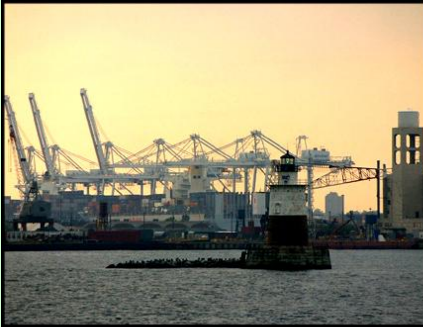
Robbins Reef

Lighthouse Tour - 25 September - Almost SOLD OUT (If you like lighthouses check out our Staten Island Tour)