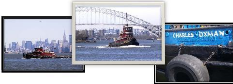
C - Tugboat with Bayonne Bridge - by Mitch Waxman L - Tugboat with City Skyline - by Mitch Waxman R - Tug Charles Oxman - by Jhoneen Preece-Doswell