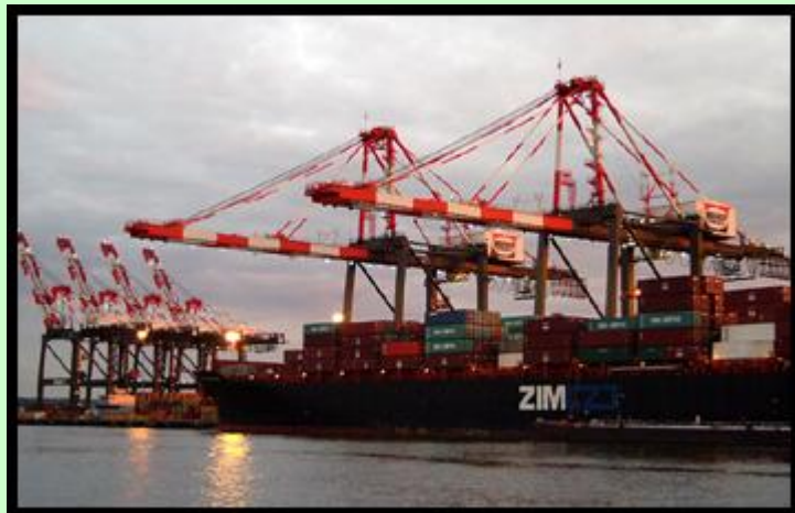
Maher Terminals