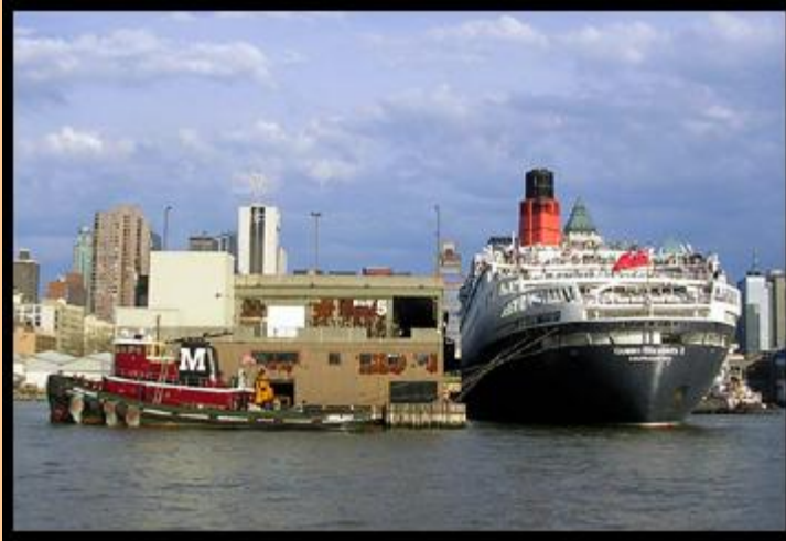
Passenger Ship Terminal in North River