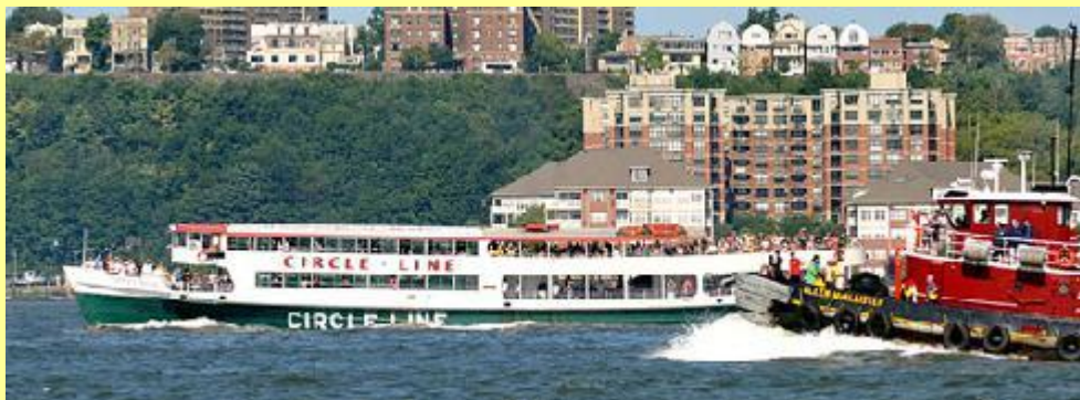
Tugboat Race with spectator boat 2009