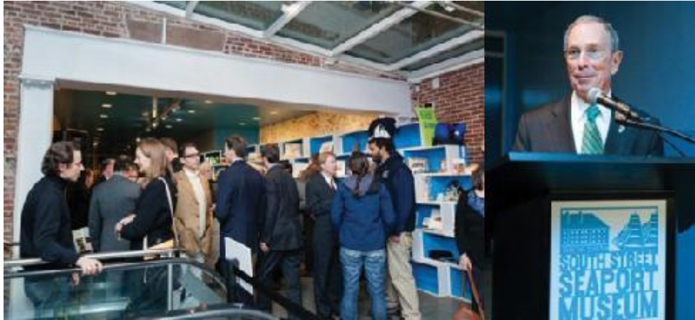
Left – a small part of the 800 or so folks celebrating the re-opening. Right – Mayor Bloomberg speaking at the celebration.

On 15 January the South Street Seaport Museum celebrated its re-opening after Superstorm Sandy with a party and reception. A surprise guest was NYC Mayor Bloomberg who said many nice things about the Museum, in a speech filled with numerous (and humorous) nautical metaphors. The event took place in the galleries of the Museum as well as at nearby Bowne & Co and was attended by several hundred supporters. Two new exhibits were in place-A Fisherman's Dream: Folk Art by Mario Sanchez and Street Shots/NYC.