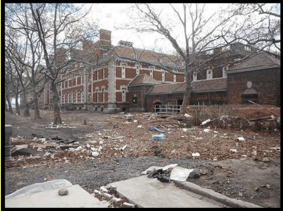
Ellis Island Immigration Museum. The storm surged onto the South Side of Ellis Island, depositing debris and flooding the basements of the historic hospital and administration buildings.

Check out the Working Harbor Committee Blog at workingharbor.wordpress.com for all kinds of harbor news and tidbits. If you want to get automatic emails on each new post, click on "Follow" and enter your email.