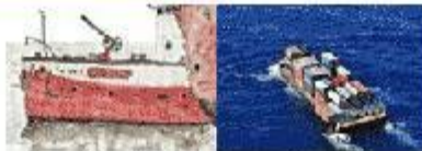
Working Harbor Committee Blog