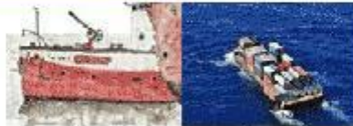
Working Harbor Committee Blog