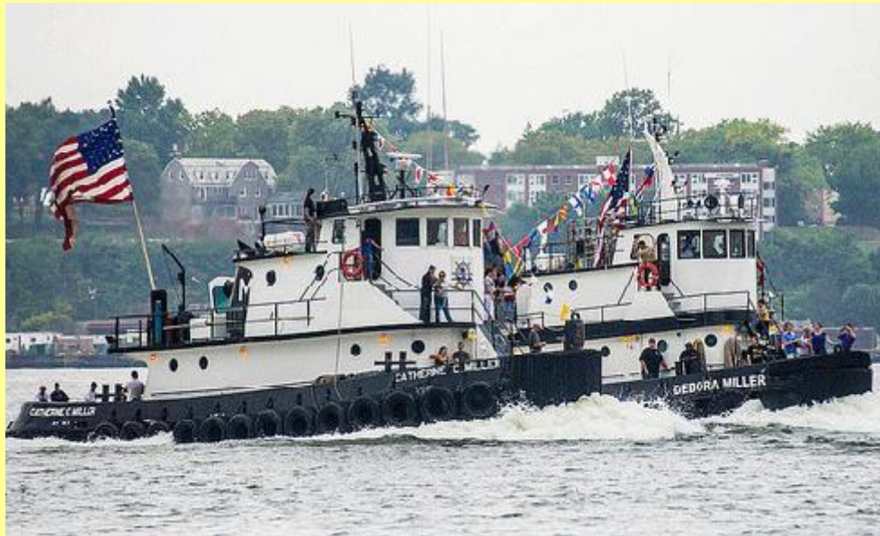
Miller tugs neck & neck